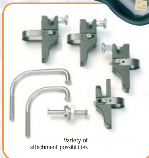
Variety of attachment possibilities